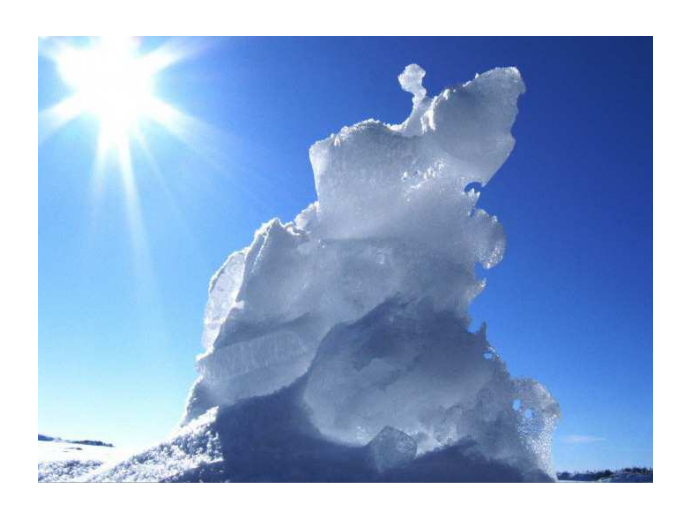
Day 1 Arrival to St. Petersburg (date?; time?). Meeting with the guide. Transfer to the hotel.