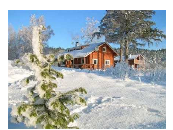
Day 3 Snowshoesing to Kukhna Shkhery Rock (15km). Walking on the frozen Ladoge lake with perspective of "merging earth and sky". Returning to the Lumivaara lodge. Night at the hotel.