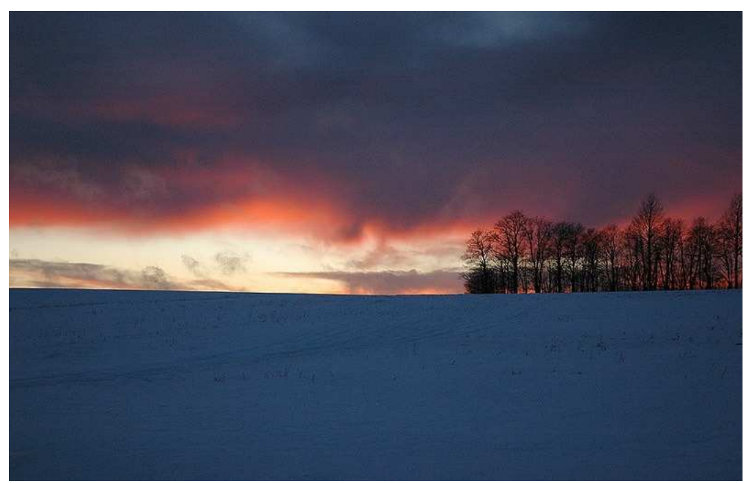
Closed to Putsaari Island