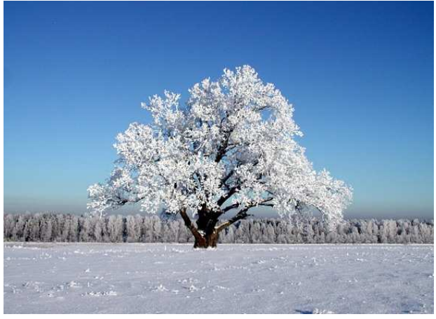
Day 2 Morning city walking. Bus transfer to Lumivaara lodge. Night at Lumivaara lodge - 2-3-4 bedrooms, WC&Shower in the lodge. Snowshoesing around the lodge.