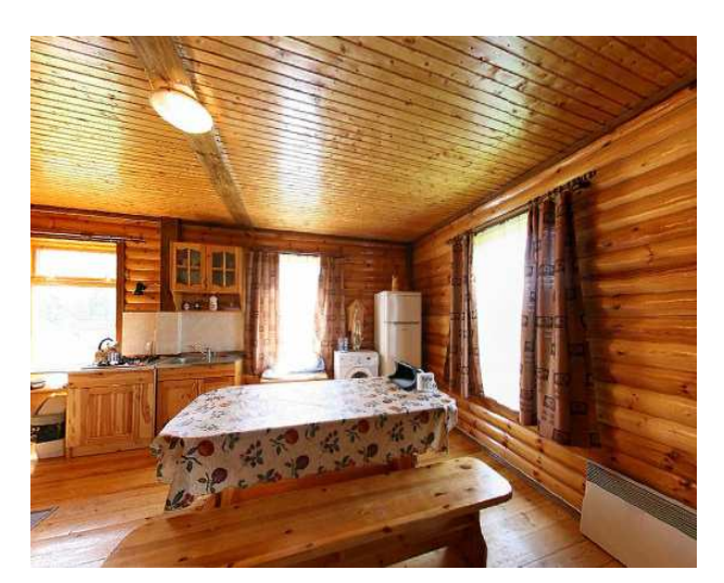
Day 5 Snowshoesing to Oppola village 6-7 km. Free time. Night at Oppola lodge – 3-4 bed room, WC&Shower in the lodge. Sauna is possible. Sauna is possible.